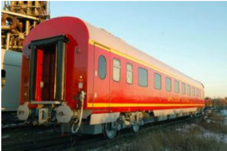
Passenger car manufactured by Transmashholding

Egyptian National Railways, which is managed by the Egyptian Railway Authority, has signed a contract with the Russian-Hungarian consortium Transmashholding-Hungary Kft. for the supply of 1,300 passenger cars. The contract has a runtime of five years from the date of signing.